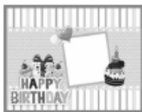
4 Birthday card