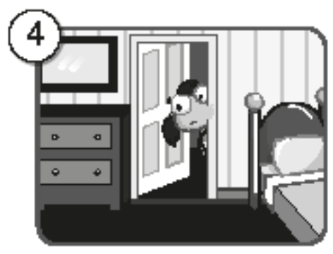
She's in the bathroom. \chi