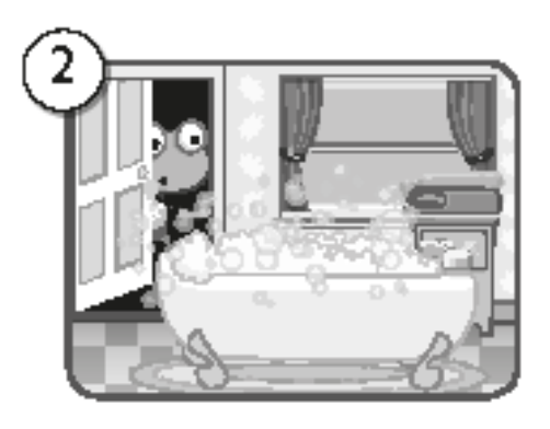
He's in the living room.