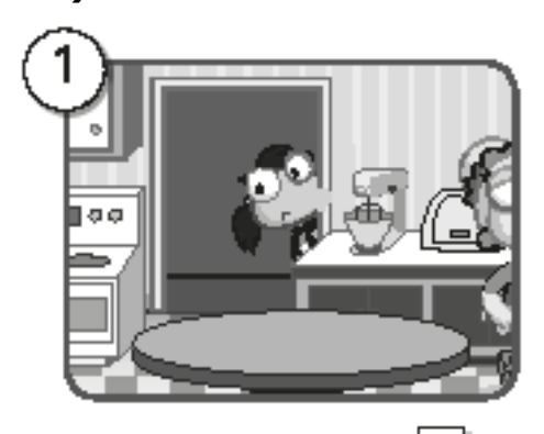
She's in the kitchen.